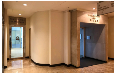
Level 2 Meiko Tailor exit to Marina Square and Suntec City